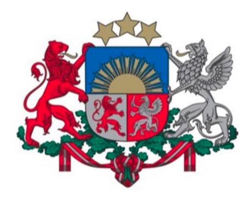
COAT OF ARMS